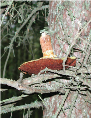
Figure 2.—Hollow Stem Larch Suillus ( Suillus cavipes ) stored on branches of black spruce by squirrels.