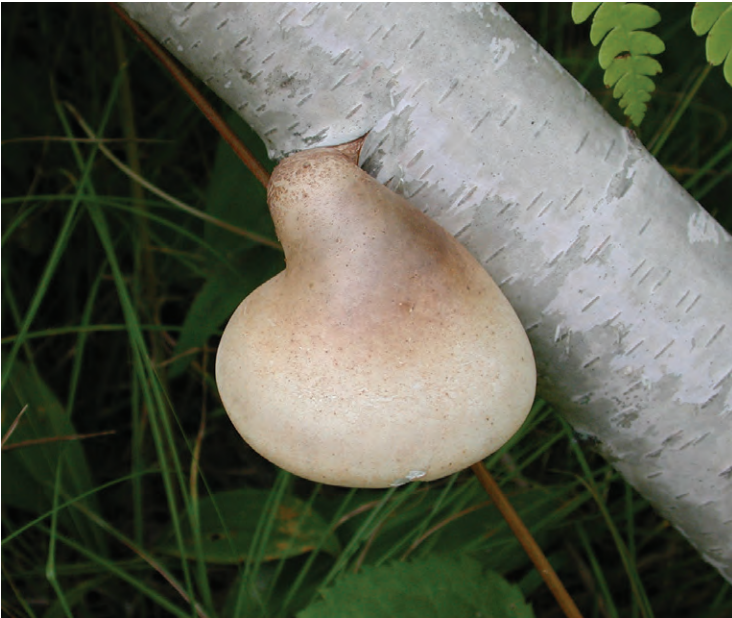
Mike Ostry, U.S. Forest Service

Fungal note: The inner material of the conk can be used as fire tinder when dry.