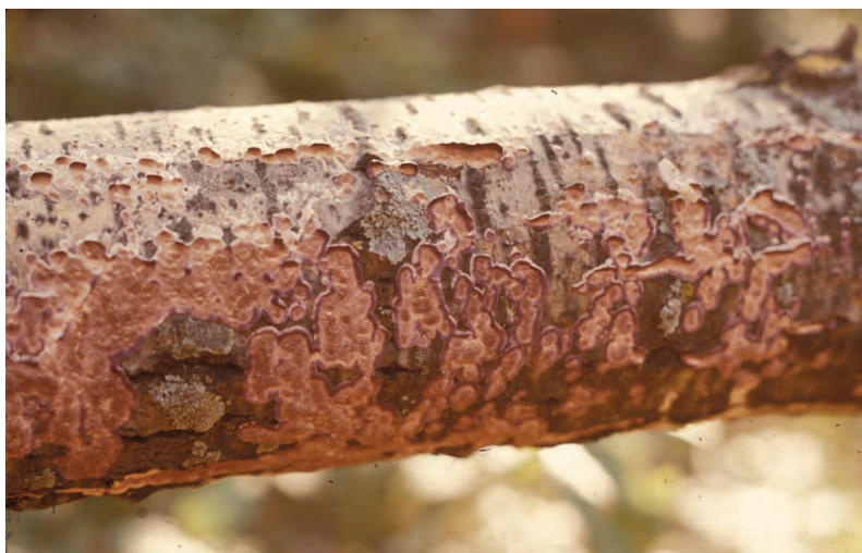
Early growth form of Violet Polypore ( Trichaptum biforme ) on the lower surface of a fallen aspen stem.

DO NOT eat any mushroom unless you are absolutely certain of its identity.