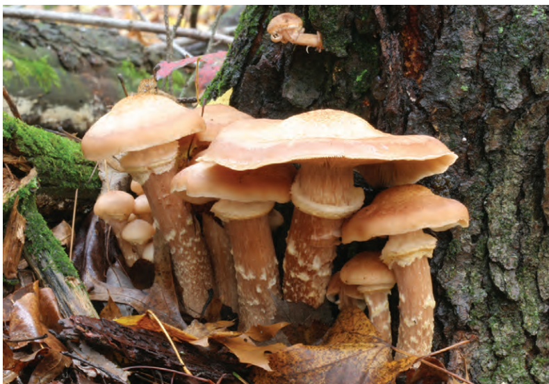
Armillaria sp. with characteristic ring (annulus) on the stems.