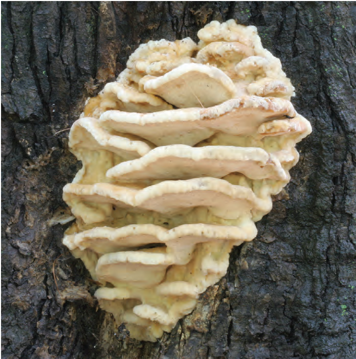
Joseph O'Brien, U.S. Forest Service

Fungal note: This fungus fruits only occasionally on individual trees, and its teeth can reach 10-15 mm in length.