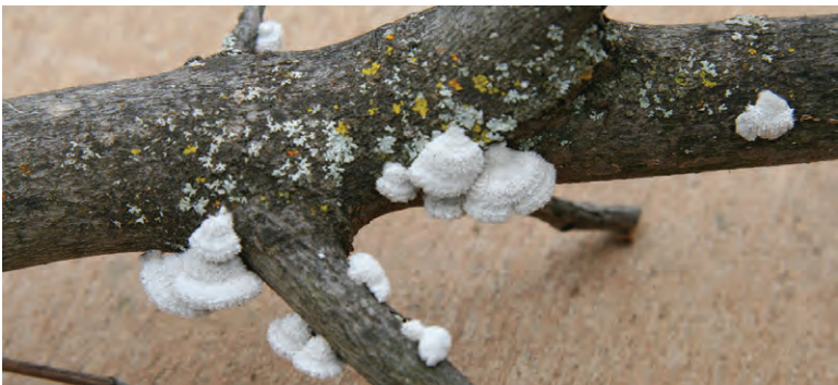
Mike Ostry, U.S. Forest Service

Fungal note: Spores of this fungus were obtained from fruit bodies after 50 years of dry storage. Each gill is split into two halves that curl in dry weather to protect the spore-bearing surface.