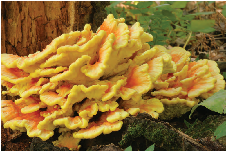
Joseph O'Brien, U.S. Forest Service

Fungal note: This fungus, also called chicken of the woods, is very common on red oaks. A similar-looking species, L. cincinnatus , grows on the roots of infected trees.