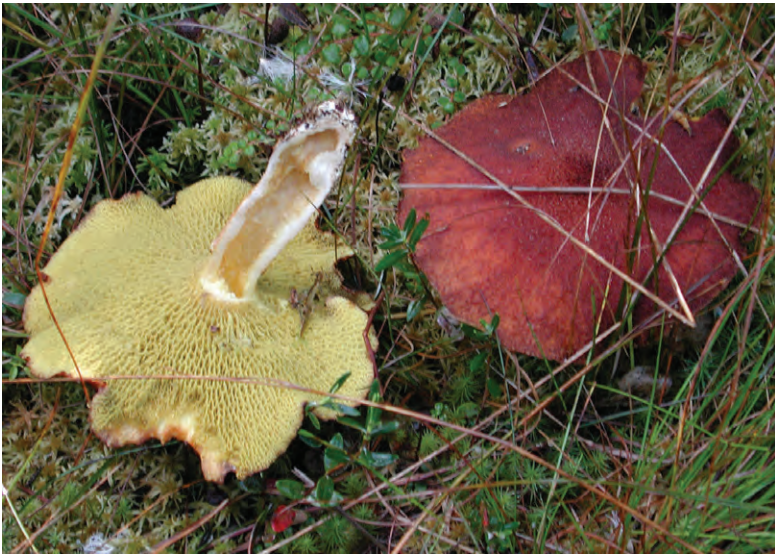
Mike Osty, U.S. Forest Service

Fungal note: Squirrels often cache this species in trees (Fig. 2).