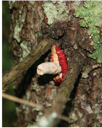
Figure 3.—Emetic Russula ( Russula emetica ) stored on branches of black spruce by squirrels.