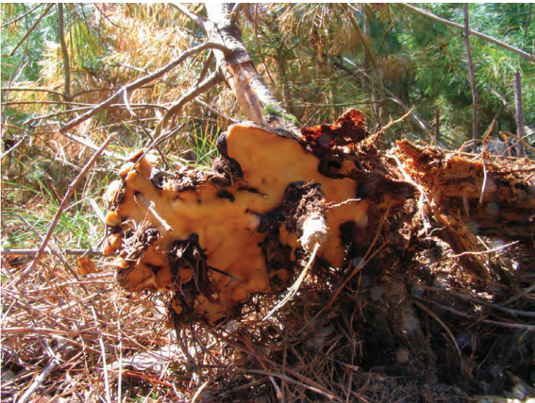
Heterobasidion irregulare , on young white pine.

DO NOT eat any mushroom unless you are absolutely certain of its identity.