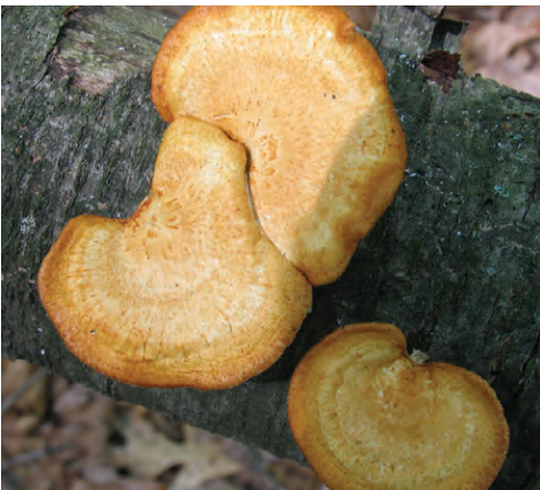
Polyporus alveolaris , bottom view.

Fungal note: Can cause decay when wood is at low moisture content.