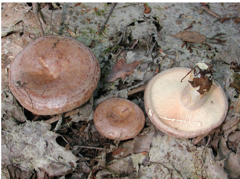
Mike Osty, U.S. Forest Service

Fungal note: The edible L. deliciosus , found in conifer and mixed conifer-hardwood stands, has an orange cap that becomes stained green when bruised and contains a yellow-orange latex.