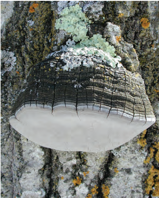
Mike Ostry, U.S. Forest Service

Fungal note: This fungus causes more wood volume loss than any other aspen pathogen; however, the resulting soft wood of affected stems is beneficial for cavity-nesting wildlife. On average, decay extends 8 feet above and 5 feet below an individual conk.