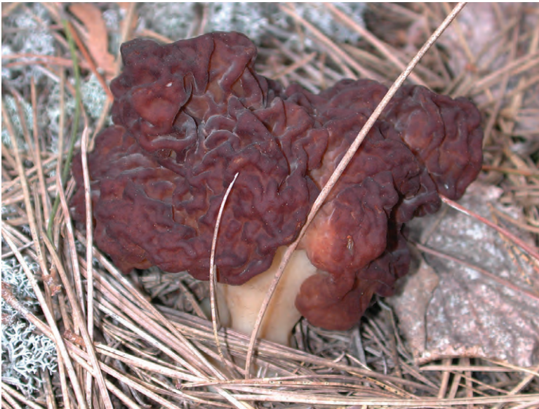
Mike Ostry, U.S. Forest Service

Fungal note: This fungus is reported to produce the compound mono methyl hydrazine, found in rocket fuel.