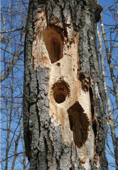
Cavities excavated by woodpeckers in aspen affected by P. tremulae .

DO NOT eat any mushroom unless you are absolutely certain of its identity.