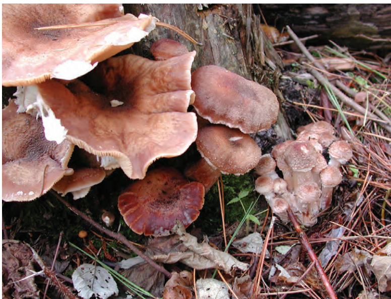
Mike Ostry, U.S. Forest Service

Fungal note: The genus Armillaria is complex and contains 10 biological species that have restricted geographical distributions and vegetation associations. Species can be distinguished only by using laboratory techniques. All species are luminescent, often glowing in patches of decayed root or stem tissue. Clones of Armillaria several hundred acres in size have been found in the western U.S.