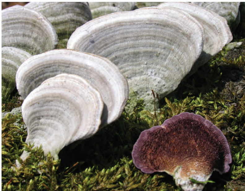
Trichaptum biforme , upper and lower surface