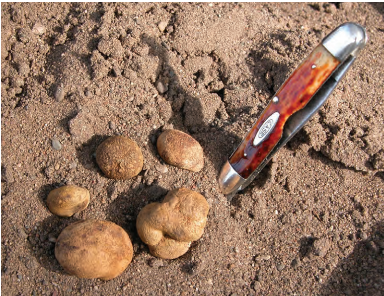
Mike Ostry, U.S. Forest Service

Fungal note: More than 200 species of Rhizopogon have been described. They are eaten and inadvertently spread by many wildlife species.