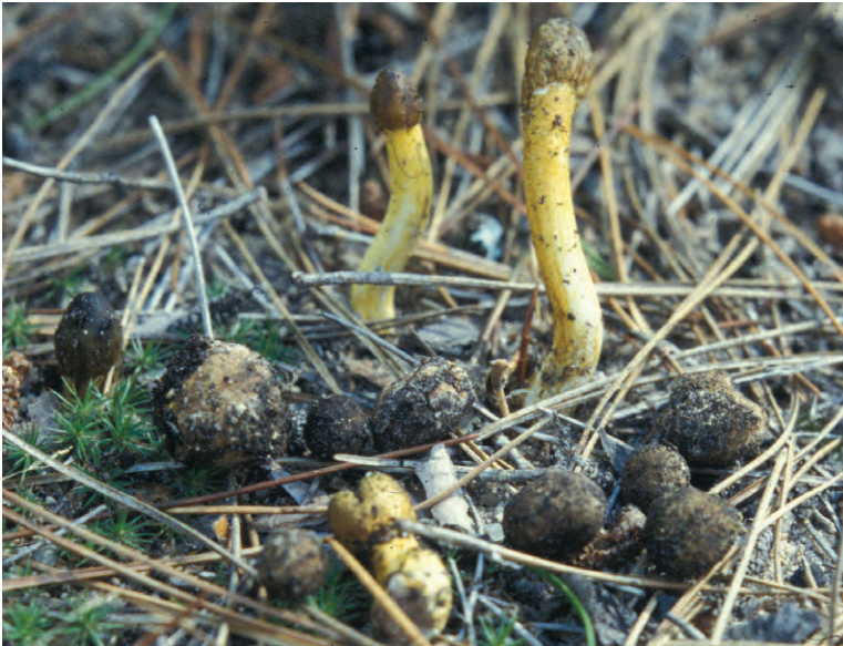
Mike Ostry, U.S. Forest Service

Fungal note: From a 1-m 2 sample area in a Minnesota jack pine stand, it was estimated that there were about 410,000 deer truffles per ha. These truffles are fed upon by many mammal species.