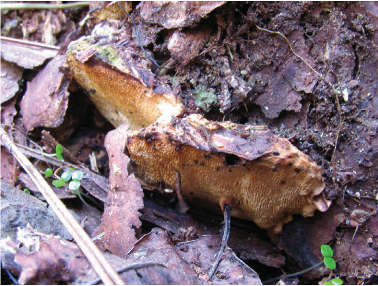
Heterobasidion irregulare , pore surface.