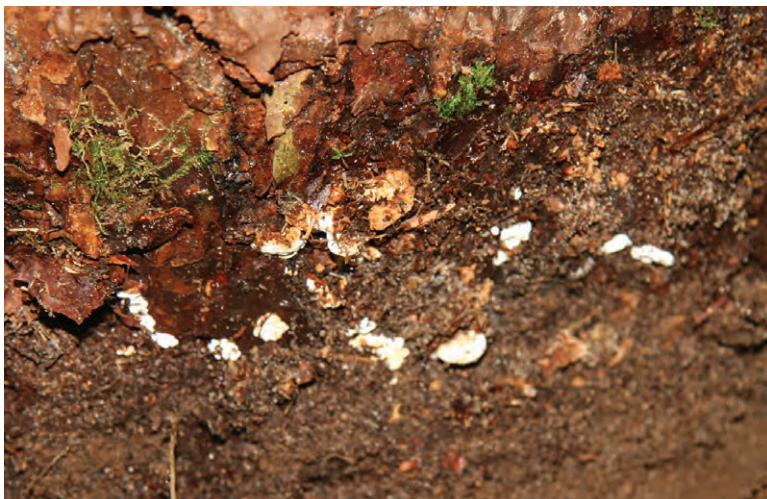
Mike Osty, U.S. Forest Service

Fungal note: H. annosum is a species complex with pine, spruce, or fir hosts. Phlebiopsis gigantea (conifer parchment; see page 58) is used as a natural biological control of H. annosum in Europe when commercial formulations are applied to fresh stumps of pine when stands are thinned.