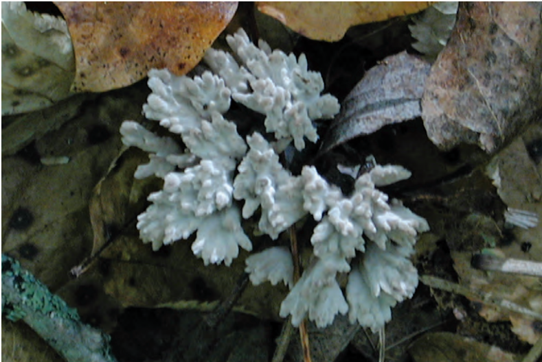
Mike Osty, U.S. Forest Service

Fungal note: The spores of the true coral fungi develop on structures (basidia) on the exterior of their branches while spores of Tremellodendron pallidum develop on basidia within the branches.