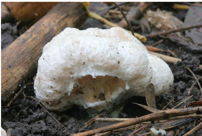
Abortive Entoloma fruiting body resulting from Armillaria mushrooms parasitized by Entoloma abortivum .

DO NOT eat any mushroom unless you are absolutely certain of its identity.