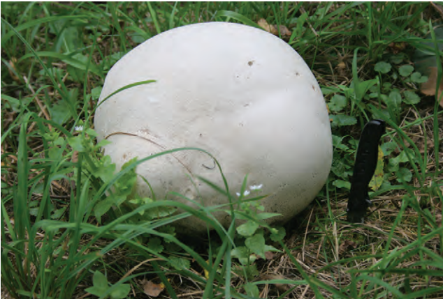
Joseph O'Brien, U.S. Forest Service

Fungal note: Giant puffballs 30.5 cm in diameter can produce 7 trillion or more spores that are perfectly adapted to wind dissemination. In calm air, spores fall at a rate of 0.5 mm per second.