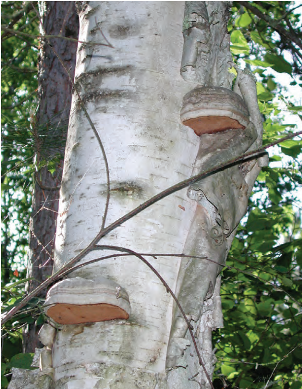
Mike Osby, U.S. Forest Service

Fungal note: The felt-like inner layer makes excellent tinder. This material, called “amadou,” has also been used as a substitute for matches after soaking it in solutions of potassium or sodium nitrate and then drying it.