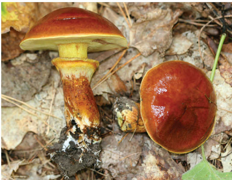
Mike Ostry, U.S. Forest Service

Fungal note: An attractive, robust mushroom found only near tamarack.