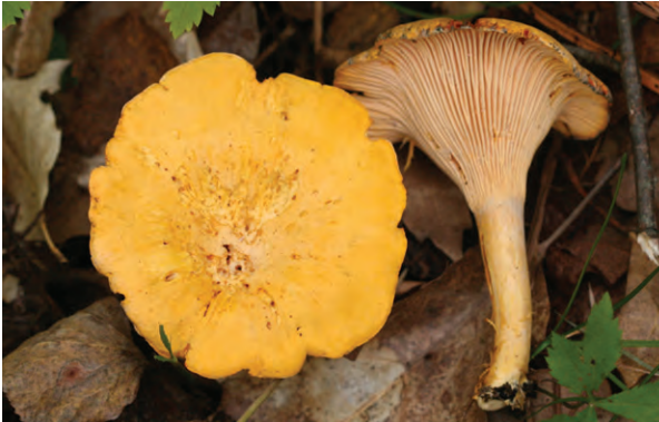
Joseph O'Brien, U.S. Forest Service

Fungal note: The Cantharellus mushrooms are known worldwide as chanterelles and are some of the very best edible mushrooms. Chanterelles are always found growing from soil, unlike false chanterelles ( Hygrophoropsis aurantiaca ) that are found on woody debris.