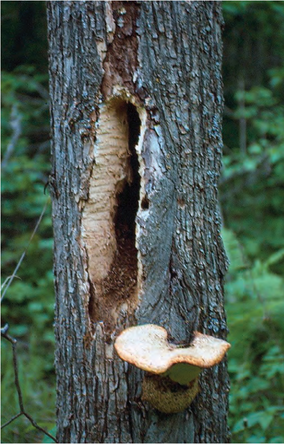
Wildlife cavity in elm with heart rot caused by Dryad's Saddle ( Polyporus squamosus ).

DO NOT eat any mushroom unless you are absolutely certain of its identity.