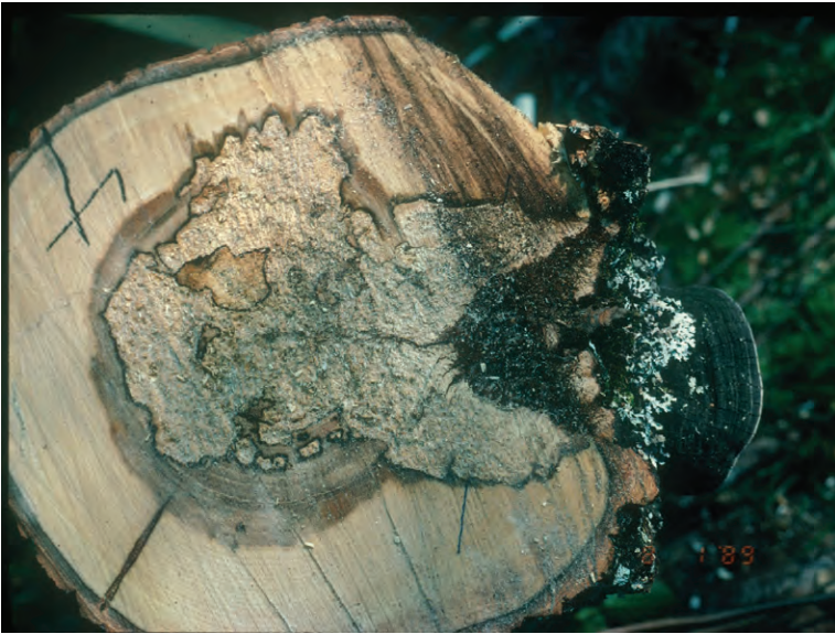
Cross section of aspen stem near a conk of False Tinder Conk ( P. tremulae ) revealing a column of soft, decayed wood that benefits cavity-nesting birds and animals.