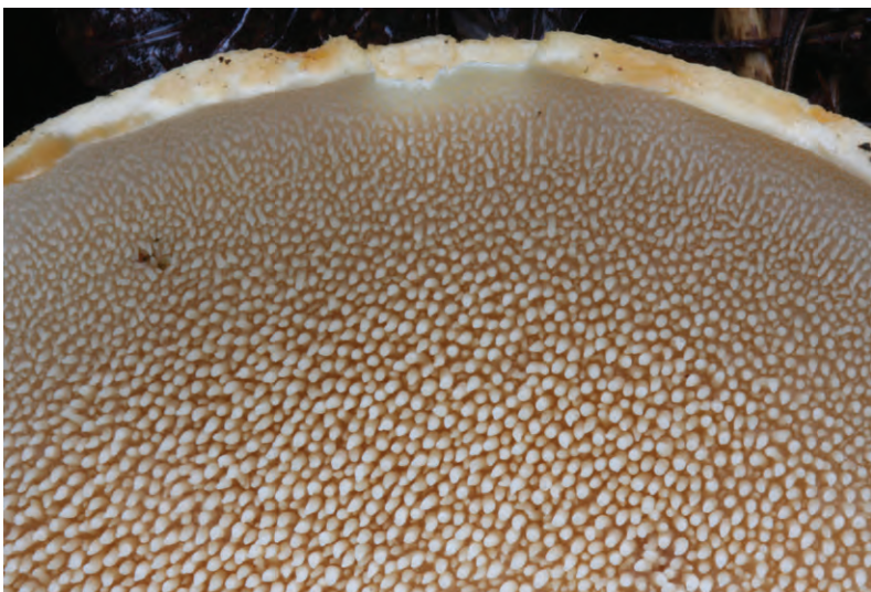
Hydnum repandum , lower surface.

DO NOT eat any mushroom unless you are absolutely certain of its identity.