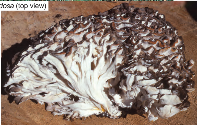
Grifola frondosa (top view)