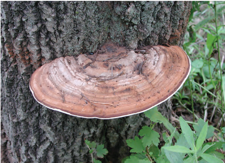
Mike Ostly, U.S. Forest Service

Fungal note: The most common perennial wood decay fungus of dead and dying hardwood trees. A single conk can produce 1.25 billion spores each hour for 5-6 months each year.