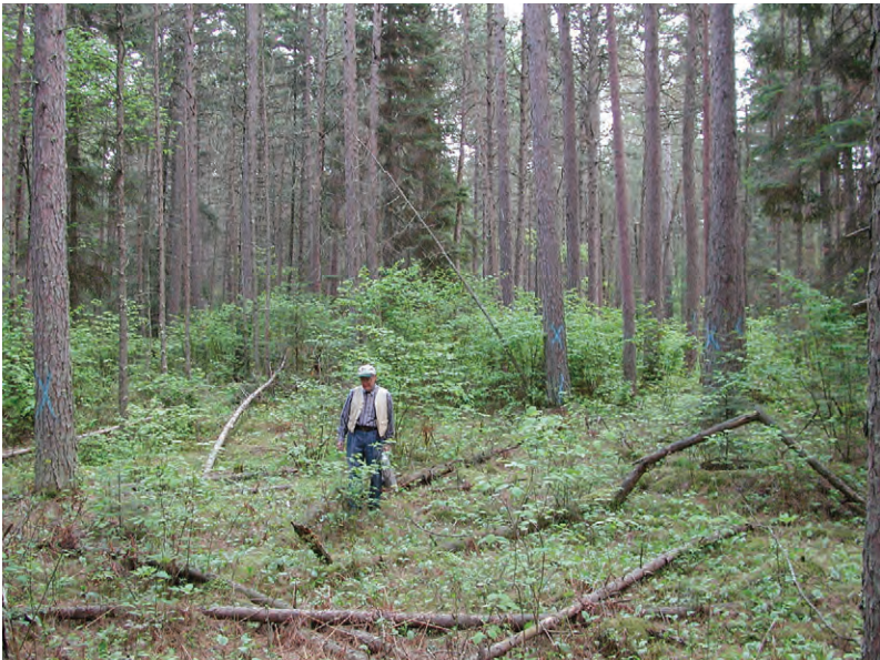
Mike Osby, U.S. Forest Service

Pathogenic fungi such as the root and butt rot fungi illustrated in this guide can be damaging, but they also provide important ecological services through nutrient cycling and development of forest structure and wildlife habitat. Distinguishing the potential positive effects from the negative effects of these fungi will enable woodland managers and owners to make informed management decisions based on their objectives.