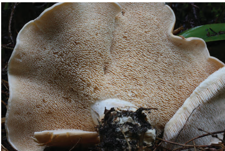
Hydnum repandum , bottom view.