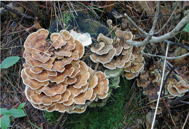
Mike Osty, U.S. Forest Service

Fungal note: Wood decayed by this fungus often has black zone lines where different clones of this species meet but do not exchange genetic material. The zone lines produce beautiful patterns in turned vases and other objects made with the affected wood, known as spalted wood.