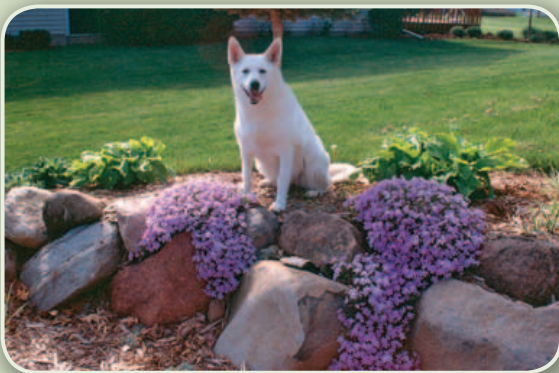
Rock walls are another creative, Firewise landscaping choice.