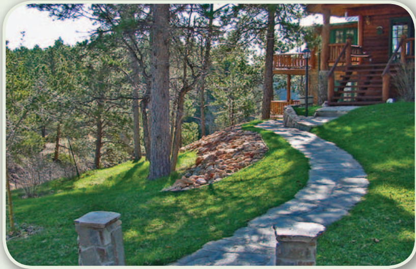
Fire burns faster uphill, making the removal of vegetation farther out essential to slow the fire down.

MAKE SURE YOUR DRIVEWAY IS AT LEAST 12 FEET WIDE WITH A VERTICAL CLEARANCE OF 14 FEET FOR FIRE DEPARTMENT VEHICLE ACCESS.