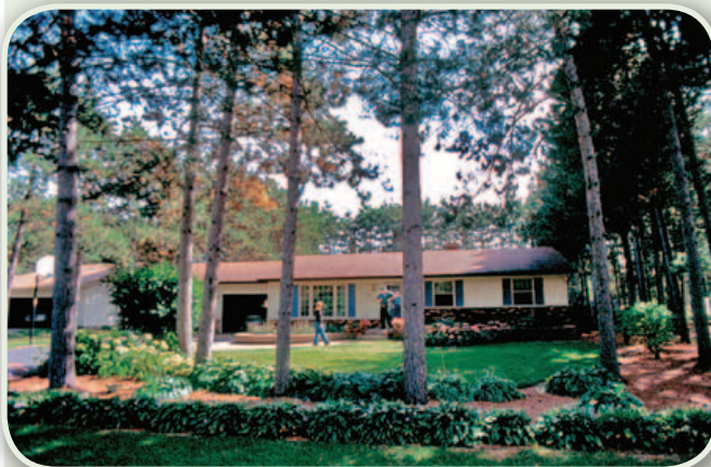
A Firewise yard in a pine forest.

Many new homeowners build within pine forests and then struggle with maintaining the aesthetic nature of the forest while protecting their homes.