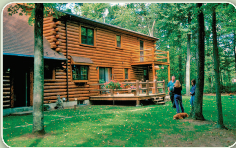
A well-managed Home Ignition Zone helps keep wildfire away.

Crown fires can catapult burning embers onto your property, including your home. Crown fires are the most destructive of all wildfires, able to kill mature trees and shrubs, and can move over large areas in short periods of time. Some surface fires, especially grass or marsh fires, can move very fast and cause great injury or even death when they are underestimated. Surface fires can become crown fires in stands where there are “ladder fuels” (i.e. branches that extend to the ground and allow a fire to climb up a tree to its crown).