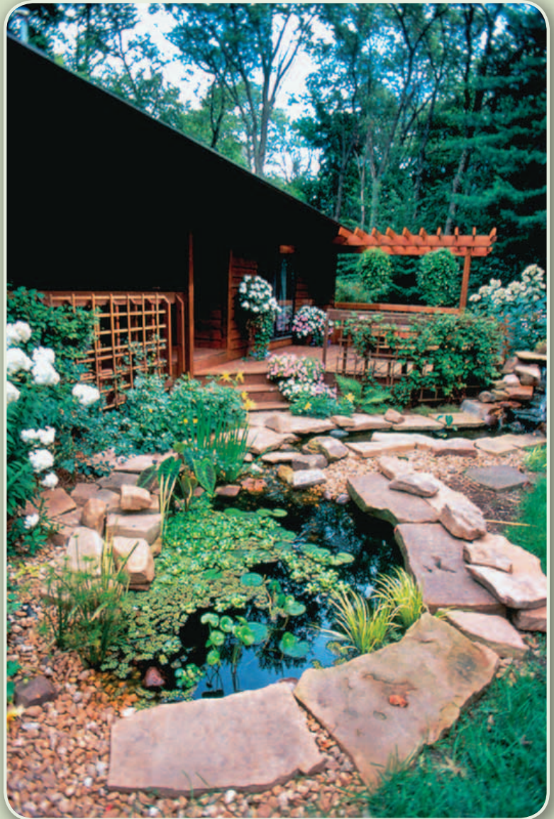
Firewise landscaping can be both effective and attractive. This pond beautifies the lawn and provides additional fire protection.

This publication is available from county UW-Extension offices, Cooperative Extension Publications – 1-877-947-7827, and from DNR Service Centers.