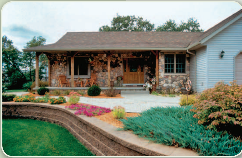
This raised garden bed is an attractive, low-maintenance, and fire-resistant landscaping choice.