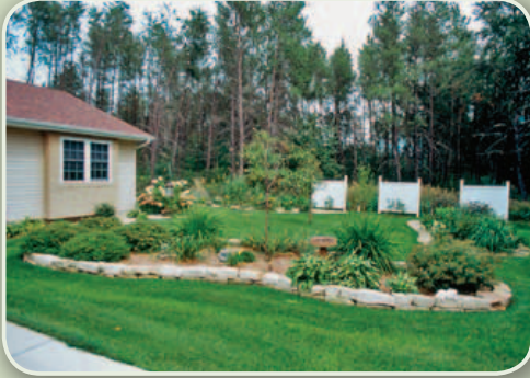
Garden "islands" keep plants isolated and away from your home's siding.