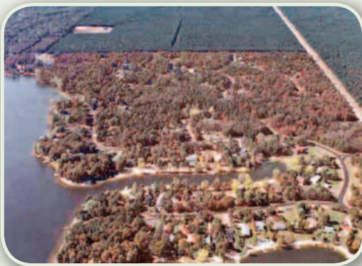
In many localities, good fire prevention requires cooperation among neighbors.

Residential developments within the wildland-urban interface often include a higher density of housing than typically found in more rural areas. In these cases, an individual's Home Ignition Zone might overlap that of a neighbor's. In these developments, if one property owner does everything possible to improve the condition of their property and the neighbor does nothing, the neighbor's fuel load might be enough to cause the loss of both homes. Talk