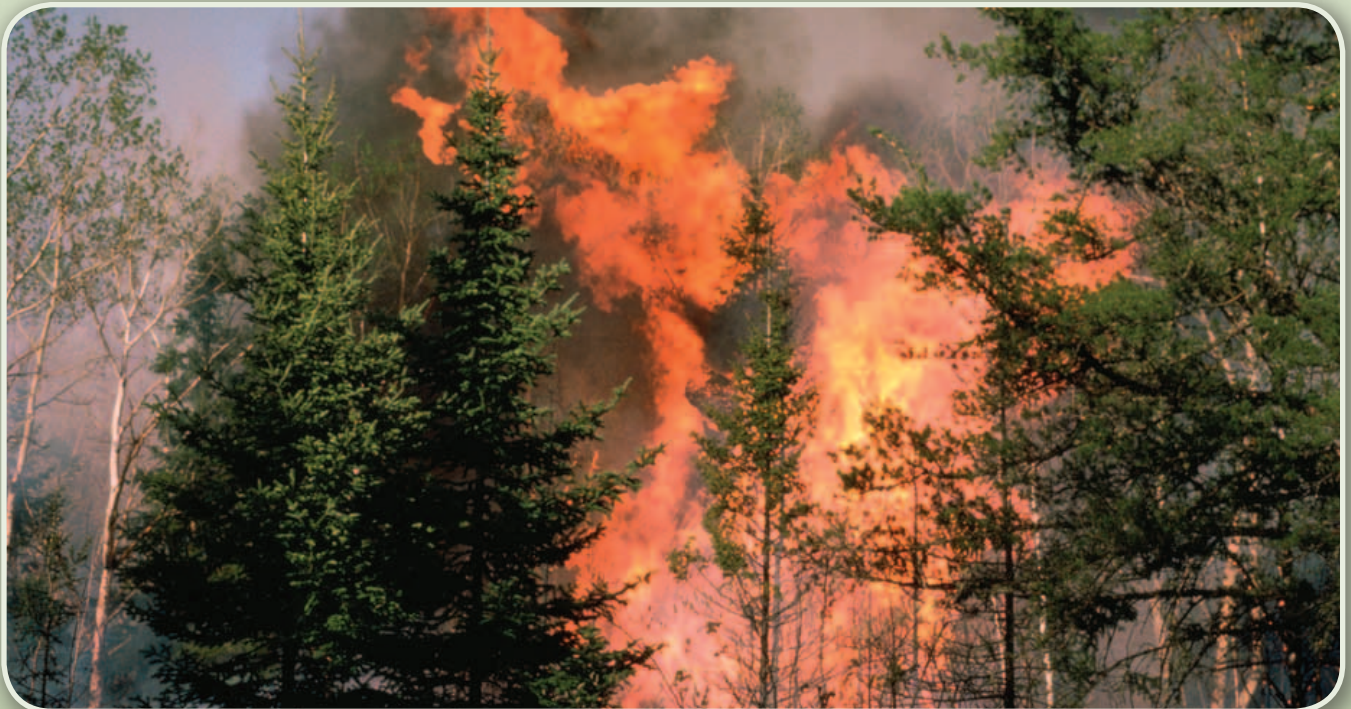
A crown fire in the tree canopy.

“...HAVING UNDEVELOPED WOODLANDS AND FIELDS IN AND AROUND A NEIGHBORHOOD MEANS THAT RESIDENTS SHOULD KNOW HOW TO PREPARE THEIR HOMES...”