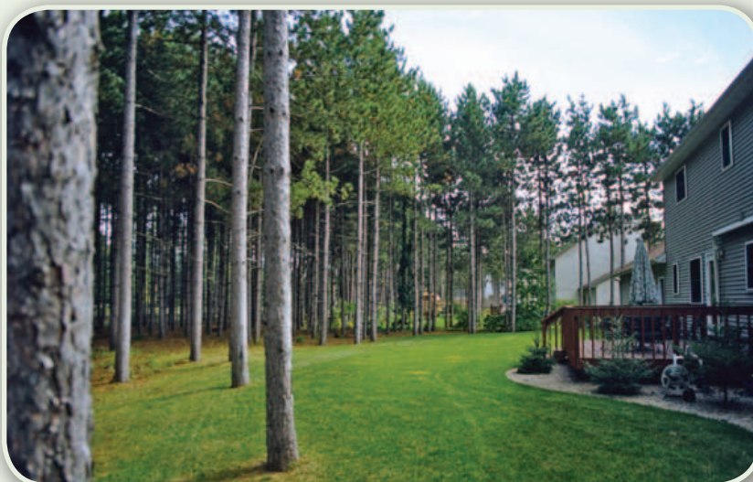
Pine trees need to be kept well spaced and pruned high.

Outside the HIZ, fire can essentially burn unabated without causing a home to ignite. However, it is important to note that most homes do not burn from high intensity fires. Most of the homes lost to wildfire in the Great Lakes region burn either from surface fires in the wake of the main fire front, or from the accumulation of windblown firebrands in advance of the fire. Simply put, Firewise landscaping and maintenance is critical.