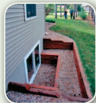
A 3-to-5-foot “fuel free zone” keeps flames away from siding.

Moving farther away from the house, landscape trees, shrubs and plants should be managed to ensure that any fire in this area remains on the ground and burns quickly (i.e. no smoldering) and with low intensity. That means keeping the lawn clean of fallen pine needles and leaves. All vegetation should be well manicured, green, and healthy.